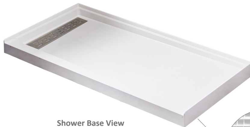
Shower Base View

This innovative NERVAL shower base features high compression molded thermo set resin throughout, providing NERVAL CastStone shower base with lightness and durability.